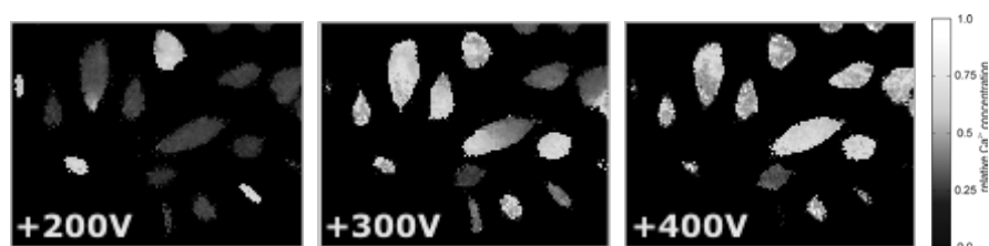
Figure 2. Cells stained with Fura-2AM and exposed to electric pulse with increasing amplitude.

Using a Cliniporator TM device, deliver one electric pulse of 100 \mu\text{s} with voltages varying from 150 to 300 V. Immediately after the pulse, acquire two fluorescence images of cells at 540 nm, one after excitation with 345 nm and the other after excitation with 385 nm. Divide these two images in MetaFluor to obtain the ratio image ( R = F_{340}/F_{380} ). Wait for 5 minutes and apply pulse with a higher amplitude. After each pulse, determine which cells are being electroporated (Figure 2). Observe, which cells become electroporated at lower and which at higher pulse amplitudes.